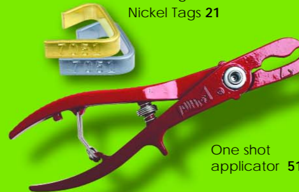
One shot applicator 51