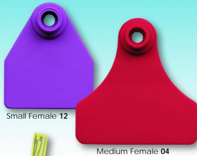
Small Female 12