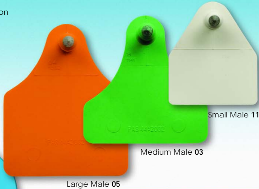
Large Male 05