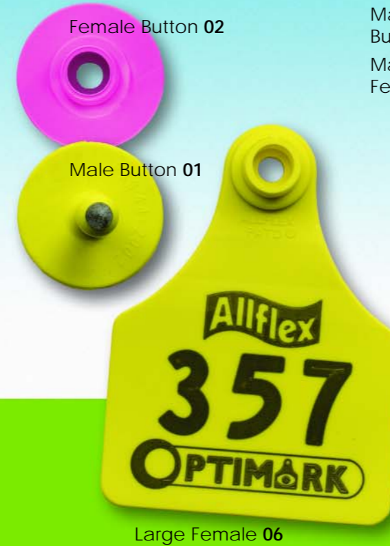
Female Button 02