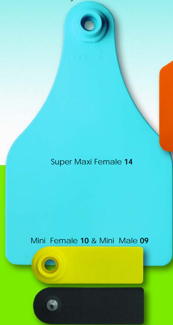
Super Maxi Female 14