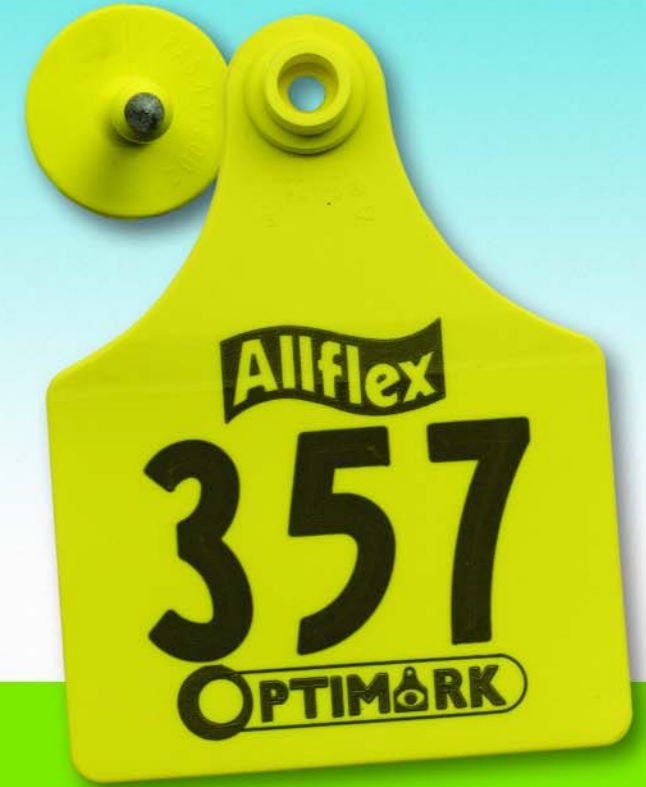
Male Button 01 ▶