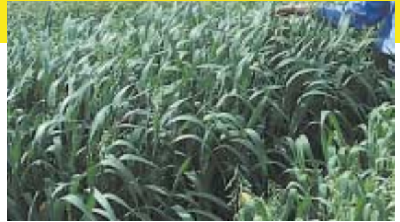
Volta showed incredible yield results in farm trials right across Australia.

“We’re rapt in Volta because of the quantity and quality of forage and rust resistance” Ann Loughnan – “Bowann” Roma